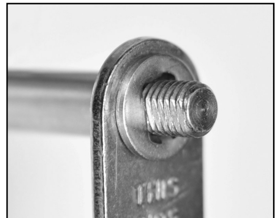
Figure 2 - Place internal tab centering washer on lever and insert shaft